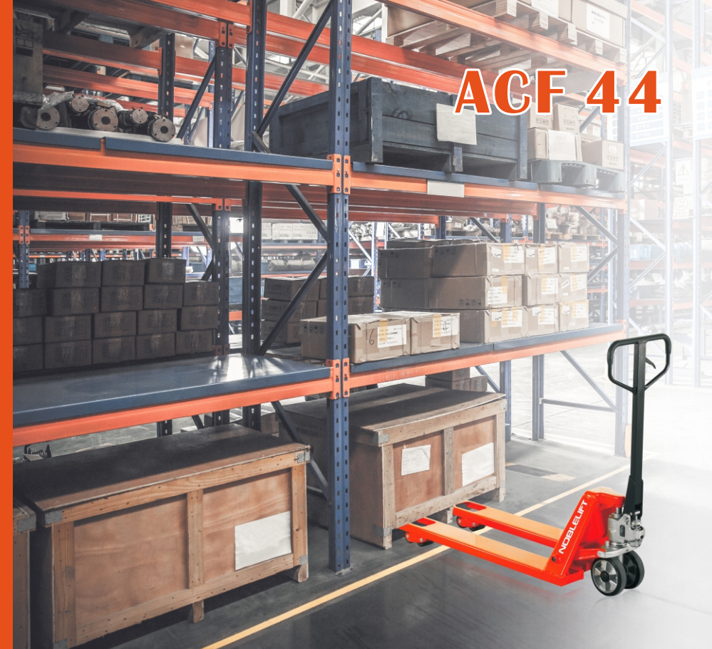
WHY CHOOSE BETWEEN PRICE AND QUALITY WHEN YOU CAN HAVE BOTH